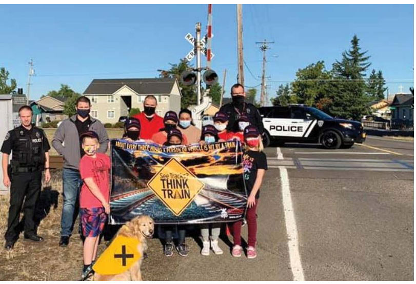
Gervais, Oregon police visited a middle school and provided rail safety information to students.