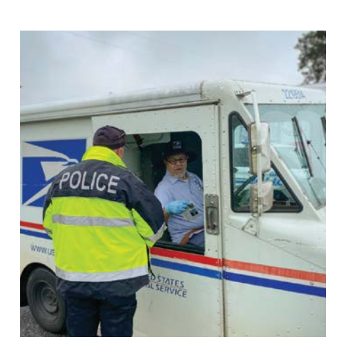
Photo: A U.S. Postal Service driver received a rail safety tips card during a positive enforcement event in South Carolina.

Wednesday, September 22 focused on Crossing Safety to educate drivers.