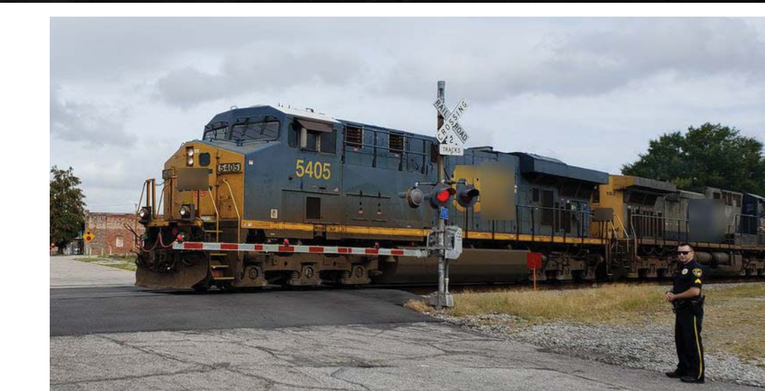
Photo: A North Carolina law enforcement officer at a crossing with a train during an Operation Clear Track event on September 21, 2021.

The Advertising Value Equivalent of Rail Safety Week media coverage reached $17M in 2021, up 32.3% from 2020. The number of television and radio news stories mentioning Rail Safety Week rose 151% from 2020.