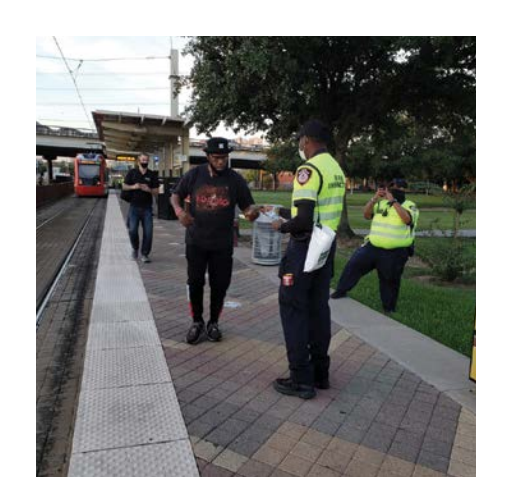
Photo: Houston Metro officers handed out safety education materials to transit riders.

Thursday, September 23 was Transit Safety Thursday for cities and states with rail transit service.