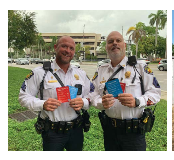
Fort Lauderdale, Florida police handed out rail safety tips cards to motorists.